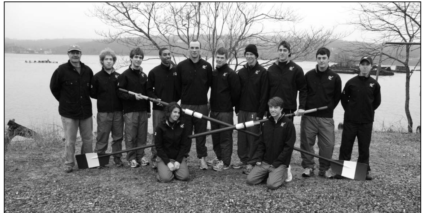
Connecticut College Men's Rowing-Spring 2008